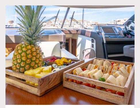
Always fresh and delicious catering

OUR EXCELLENT CATERING IS A NICE TREAT PREPARED ESPECIALLY FOR YOU. SOMETIMES AN ITEM MAY DIFFER FROM WHAT IS SHOWN IN THIS MENU.